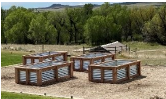
Victory Garden at the Wyoming Home for Veterans in Buffalo