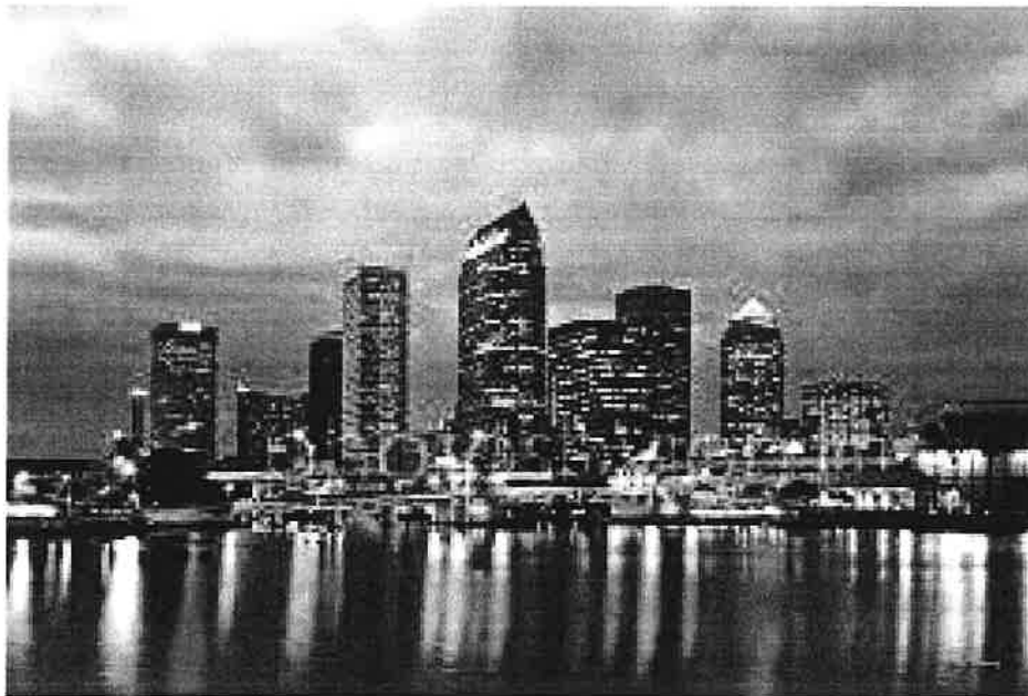
Tampa downtown Skyline