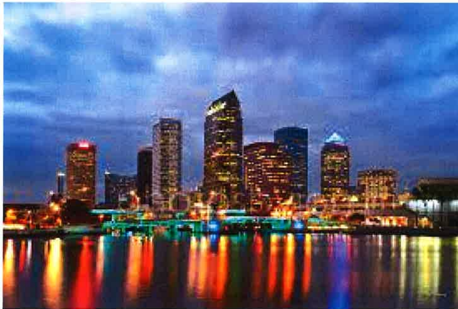
Tampa downtown Skyline