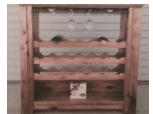
(DOES Raffle - Wine Rack)